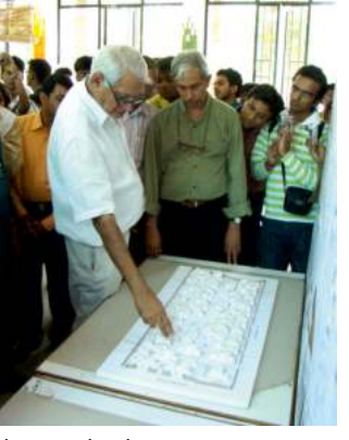
'Discussion' amongst the Masters and 'Input' by the Master