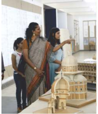
'Exhibition' of the students' work