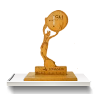
Trophy in ZONASA'06 in SCET, Surat