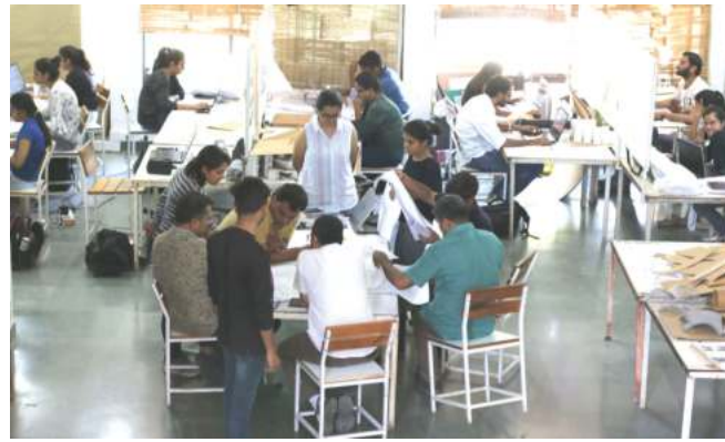
'Intense Discussion' on 'Design' by the Faculty in the 'Studio'