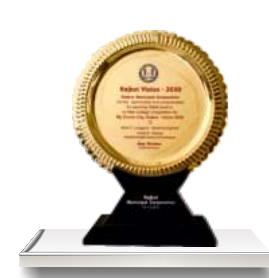
Award for Rajkot Vision - 2030 by RMC