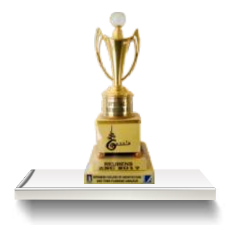
Reubens Trophy in ZNC 2017