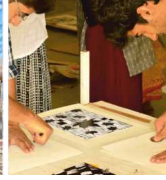
Students 'Exploring' the best-way of learning - 'Learning by Doing'