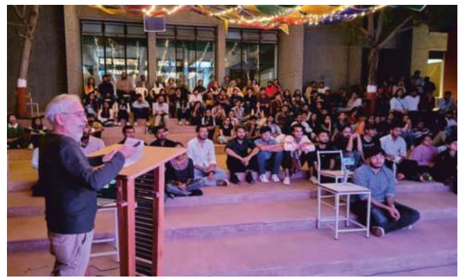
'Presentation & Professional In-sight' by the invited guest