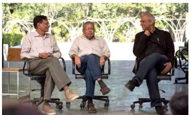
'Re-union' of the Initiators of IPSA